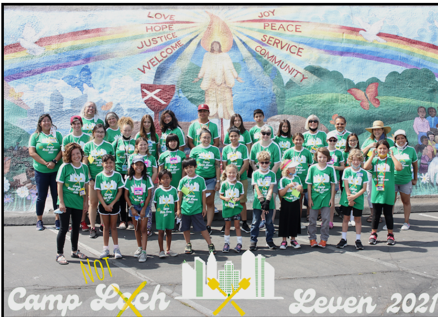
Our official Camp Not Leven photo! We had so much fun!

We spent the month of July catching up on things we'd missed, like camp, Christmas, and celebrating Tesa's milestones. This edition of The Visitor features pictures of many of these activities.